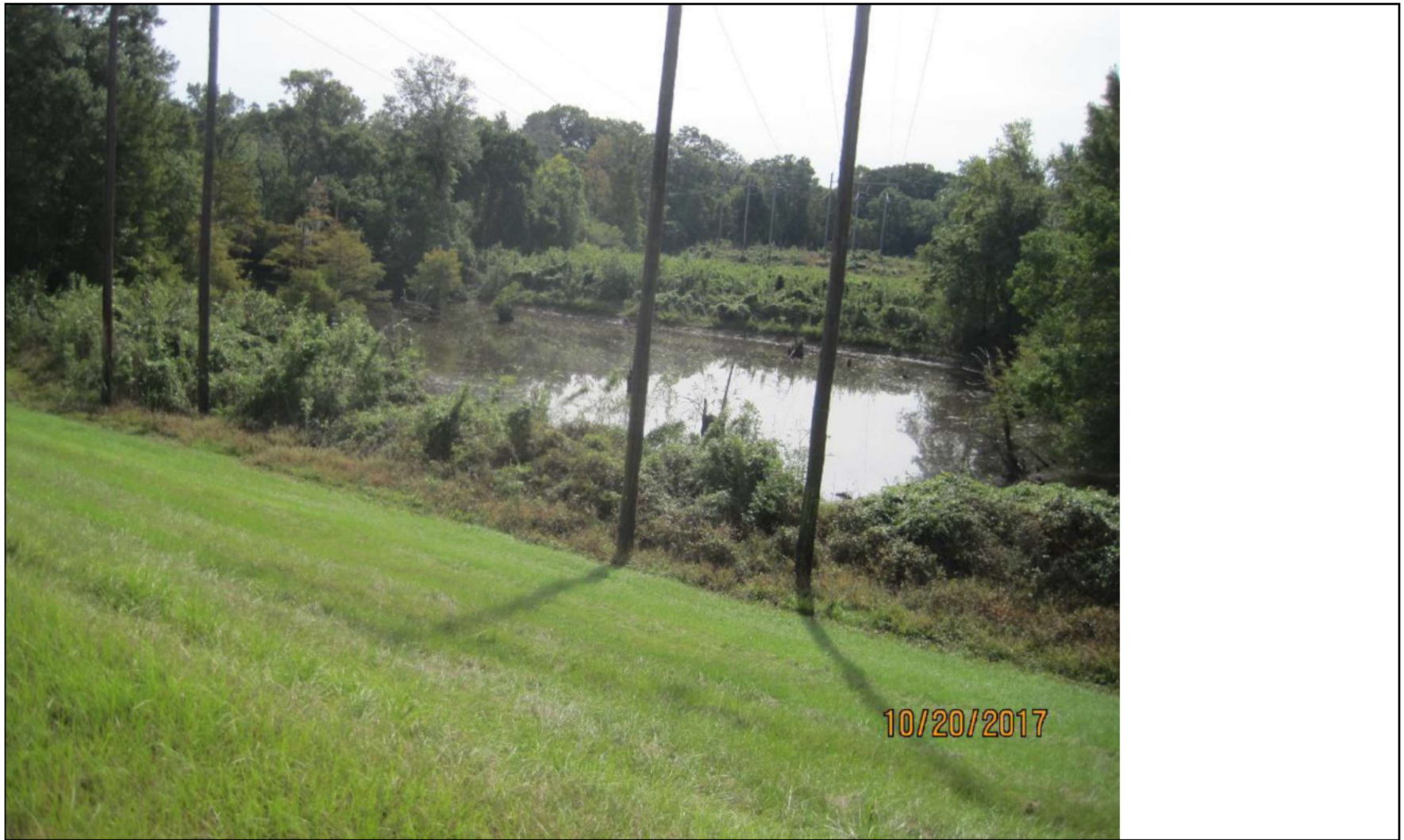
Inspect ID: JAXF_2017_a_0003 Title: USACE_CEMVK_JAXF_2017_a_0003_1.jpg Rated Item: 3. Encroachments Caption: Rating: Minimally Acceptable; Remarks: STA 100 RS 2 large double pole electric transmission lines within 10' of toe.; Action: NA; Station_1: 100

For use during Initial and Continuing Eligibility Inspections of levee segments / systems