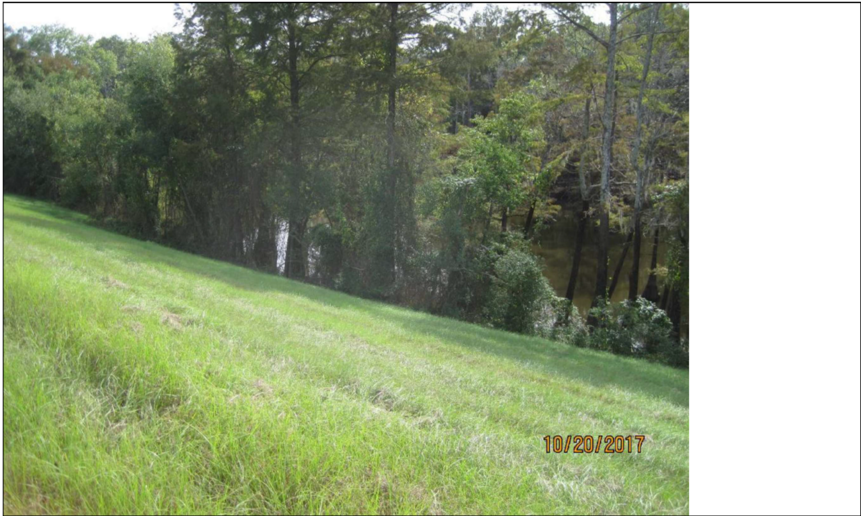
Inspect ID: JAXF_2017_a_0004 Title: USACE_CEMVK_JAXF_2017_a_0004_1.jpg Rated Item: 1. Unwanted Vegetation Growth Caption: Rating: Minimally Acceptable; Remarks: STA 88 RS Vegetation within 15' of toe; Action: NA; Station_1: 88

For use during Initial and Continuing Eligibility Inspections of levee segments / systems